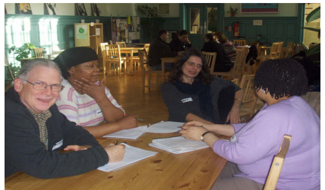
Debating tactics for campaigning

We have residual funding from the project to enable us to hold three further seminars: Newcastle, Oxford and Cardiff. As our trainer will have given birth by May, we plan to hold these seminars later in the year, and will publish details on the website.