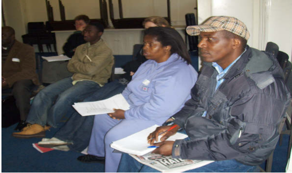
Train the Trainer workshop in Nottingham

We recognise that it would be very valuable to be able to offer ongoing support to those who are delivering this training in their own areas, and are seeking further funding for this purpose.